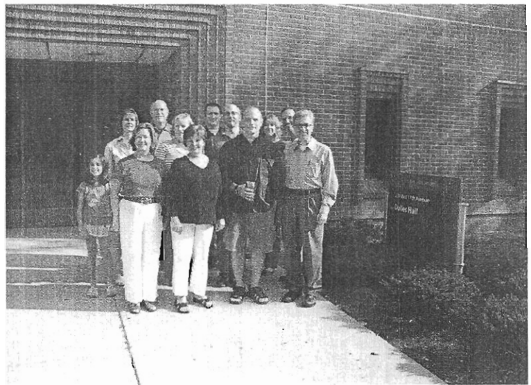
Some of the Department's staff (and a visitor on the left) outside the 17th Ave. entrance to Dulles Hall