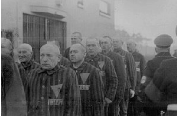
Prisoners of Sachsenhausen, 19 December 1938