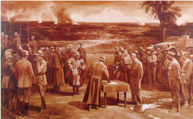
Mark Tansey, “Triumph of the New York School” (1984).