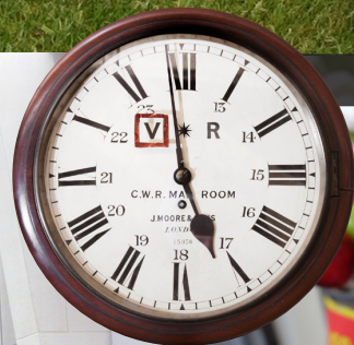
Cabinet War Rooms, London