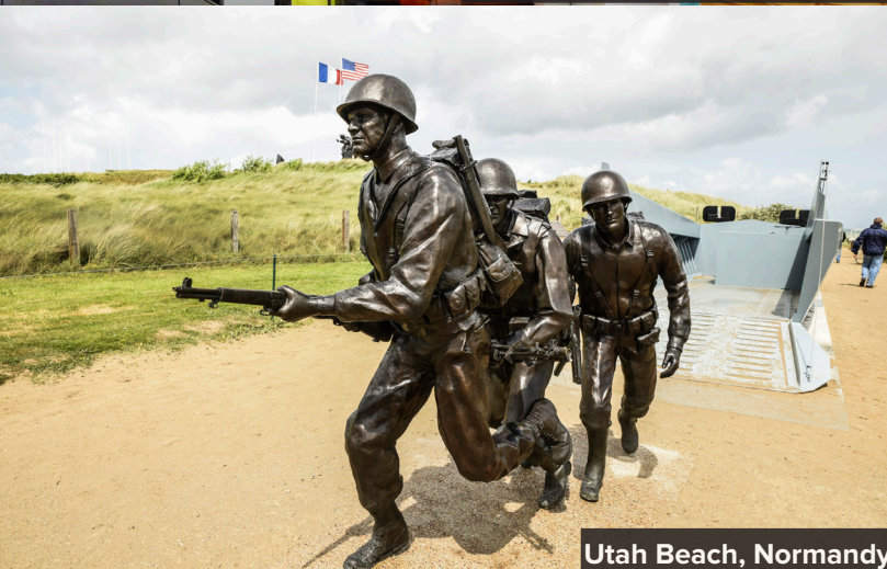
Utah Beach, Normandy