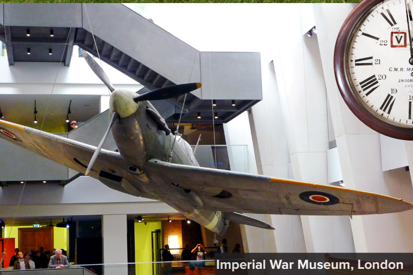
Imperial War Museum, London