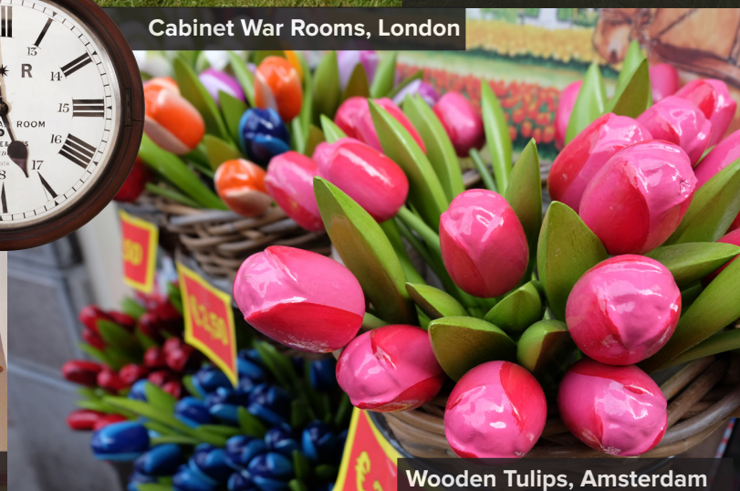
Wooden Tulips, Amsterdam