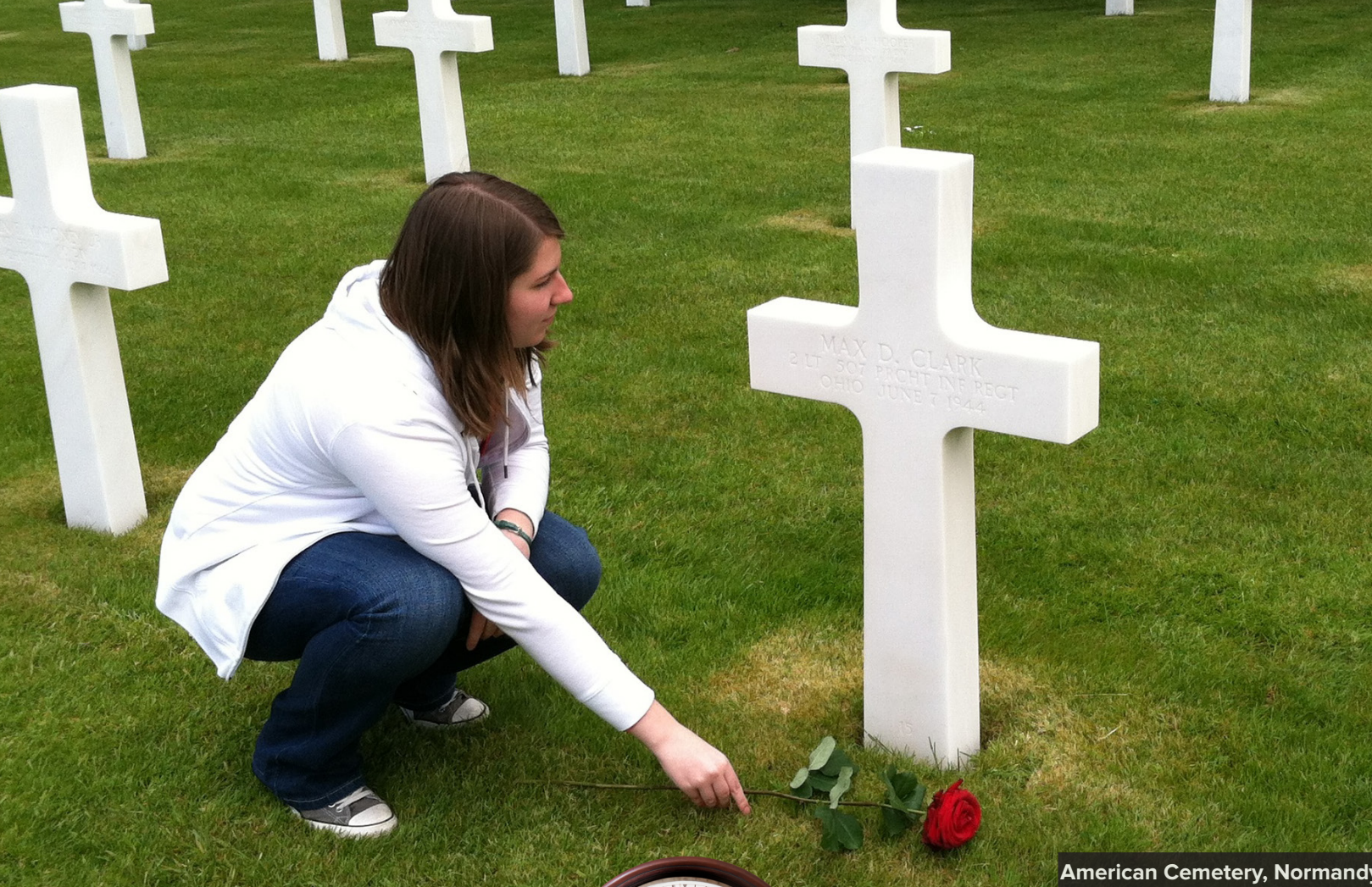
American Cemetery, Normandy